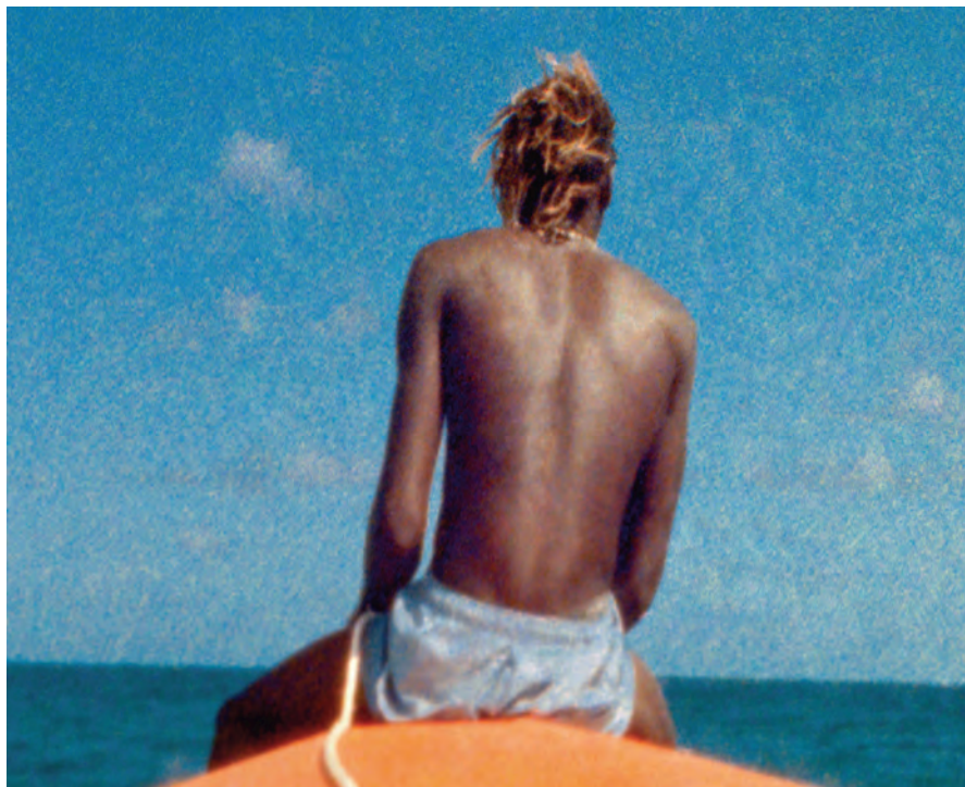
Steve McQueen, Ashes, 2002-2015. Video still.