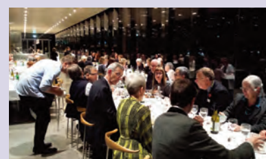
Pilkington supper in the café in the trees.