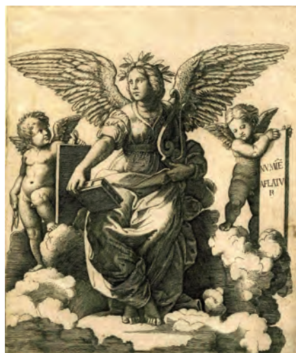
Raimondi after Raphael, Poetry c 1515.

Manchester University Press has published an extensively illustrated catalogue. This and prints are on sale in the Shop. Remember Friends' discount is available.