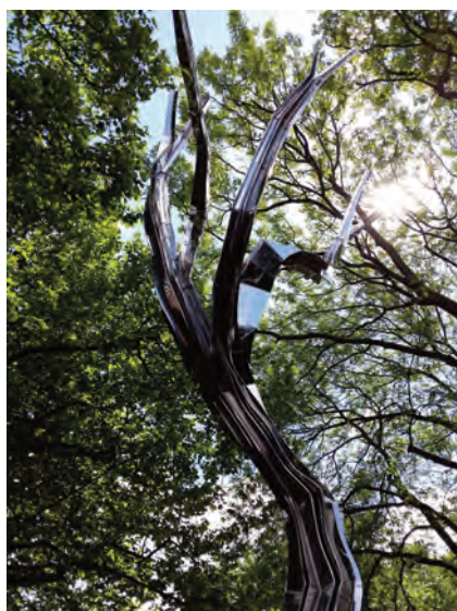
Untitled 2016, Anya Gallacio's steel tree as seen from the café.