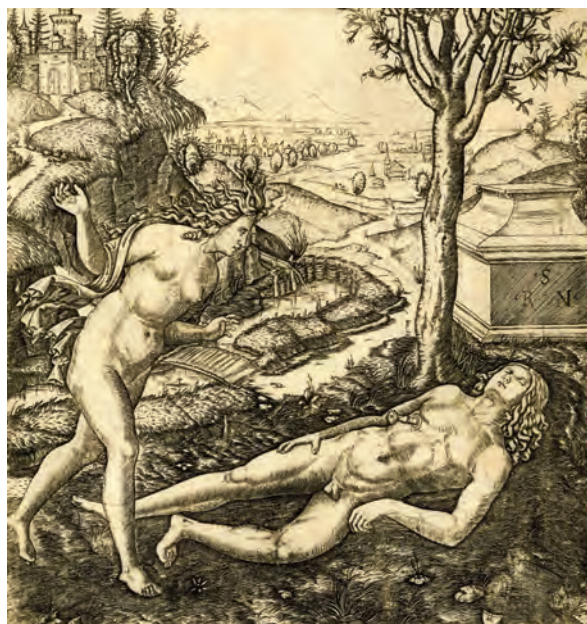
Raimondi, Pyramus & Thisbe, 1505.