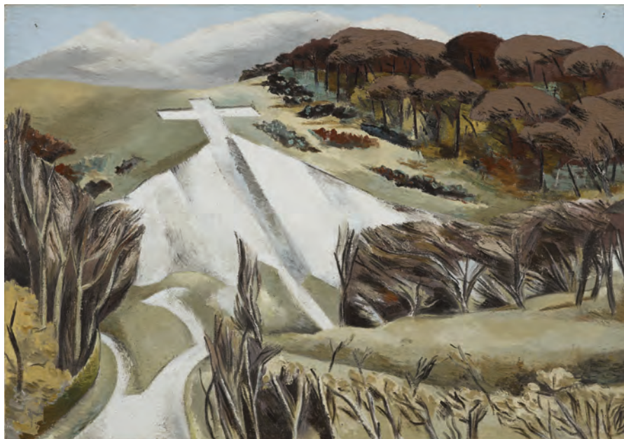
Paul Nash, Whiteleaf Cross, 1931.

Works from the Whitworth appear in exhibitions all over the world!