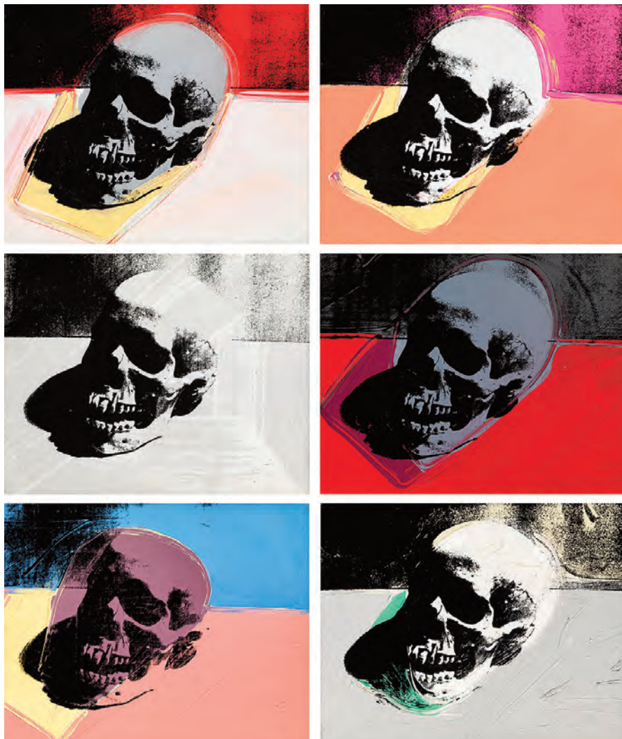
Andy Warhol, Skulls, 1976. ARTIST ROOMS, National Galleries of Scotland and Tate. Acquired jointly through The d'Offay Donation with assistance from the National Heritage Memorial Fund and the Art Fund 2008.

A stimulating and controversial show drawn from a collection of international modern and contemporary art owned by National Galleries of Scotland and Tate.